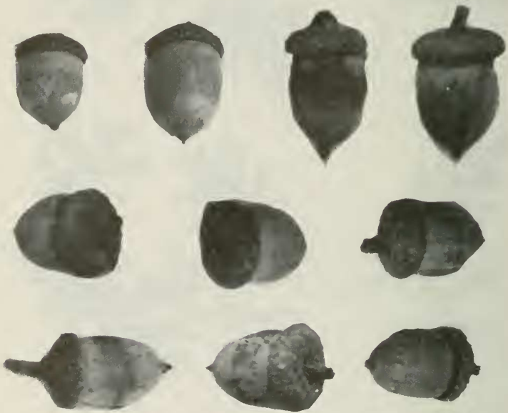
FROM TREE # 1 ACORNS OF QUERCUS SHUMARDII STENOCARPA X 92%